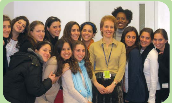
New York Psychiatric Institute of Columbia Presbyterian Hospital